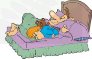
I fell asleep