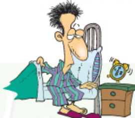
I got up