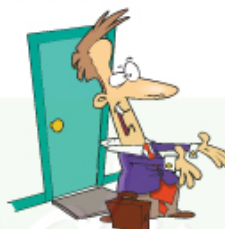
I arrived home