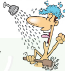
I took a shower