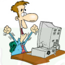
I finished work