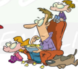
I watched TV