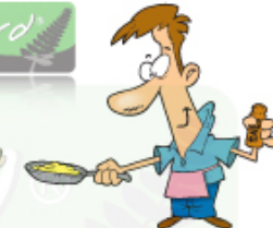
I cooked dinner