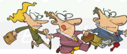
I went to work