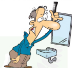
I combed my hair