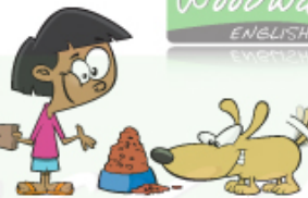
I fed the dog