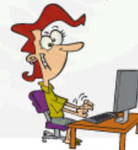
I answered emails