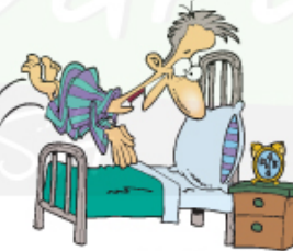
I went to bed