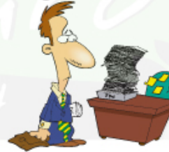
I started work