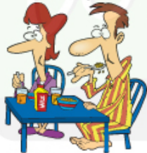
I had breakfast