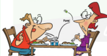
I had dinner