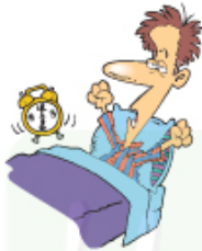
I woke up